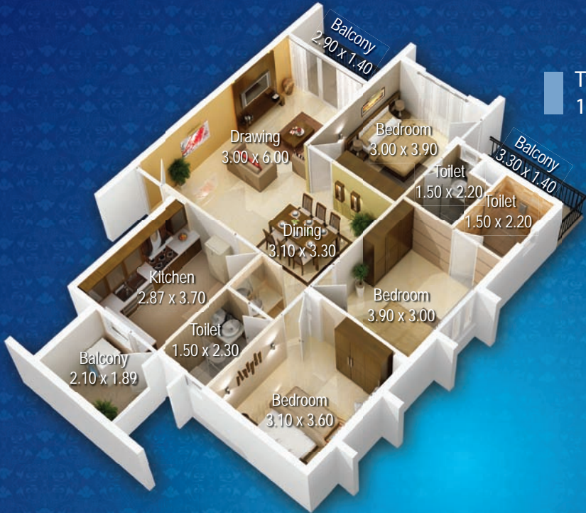
Type E - 3 BHK 1536 sft.