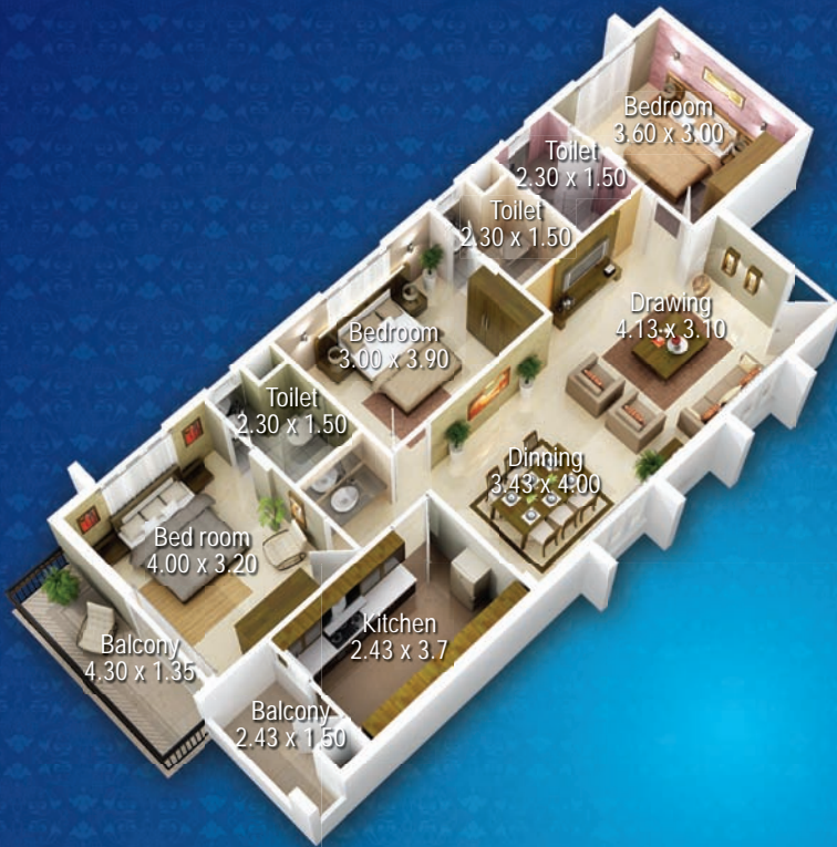
Type A - 3 BHK 1506 sft.