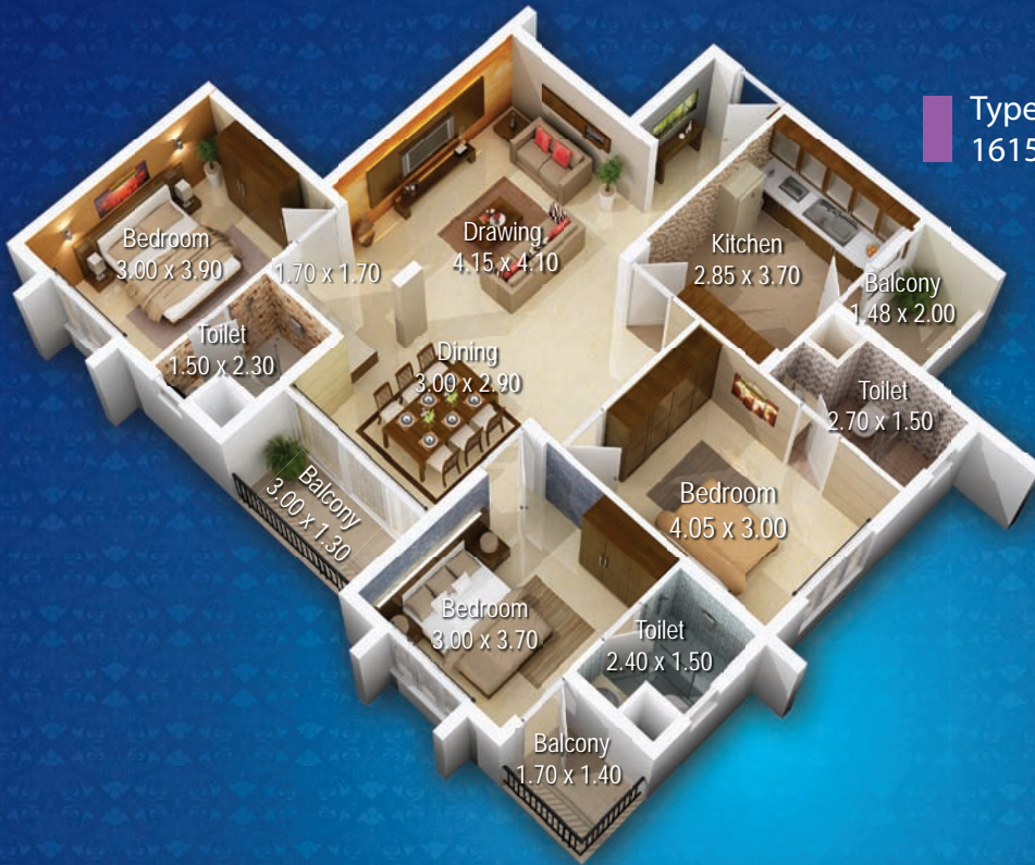
Type G - 3 BHK 1615 sft.