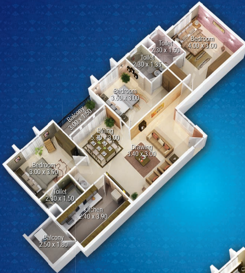
Type C - 3 BHK 1587 sft.