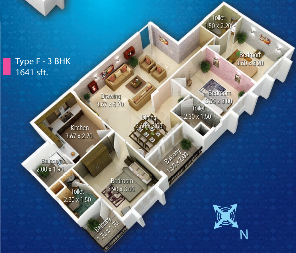
Type F - 3 BHK 1641 sft.