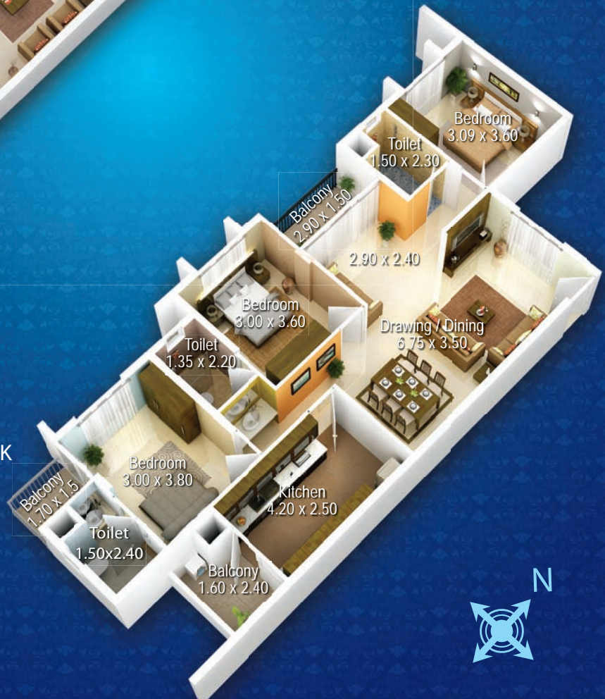
Type D - 3 BHK 1590 sft.